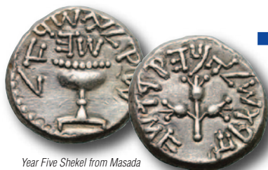
Year Five Shekel from Masada in Israel, 70 C.E.