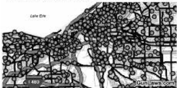
FEDERAL “GUN-FREE SCHOOL ZONES” CLEVELAND 2005 Travel thru any dot = 5 years in prison 18 USC §922(q)

Unenforceable. A joke. A federal crime against the public. Infringement defined.