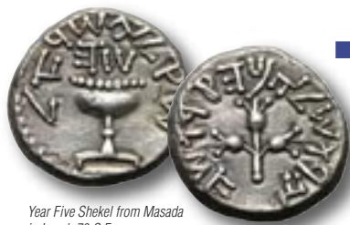
Year Five Shekel from Masada in Israel, 70 C.E.