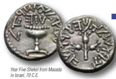
Year Five Shekel from Masada in Israel, 70 C.E.

JPFO's Mission Statement: 1. Destroy "gun control" (code words for disarming innocent people)". 2. Expose the misguided notions that lead people to seek out "gun control." 3. Encourage Americans to understand and defend all of the Bill of Rights for all citizens. The Second Amendment is the "Guardian" of the Bill of Rights. *So-called gun control is not a credible policy position: it does not control guns nor does it control criminal behavior. What it does is disarm the innocent, leaving them helpless in the face of petty criminals, tyrannical governments and genocide.