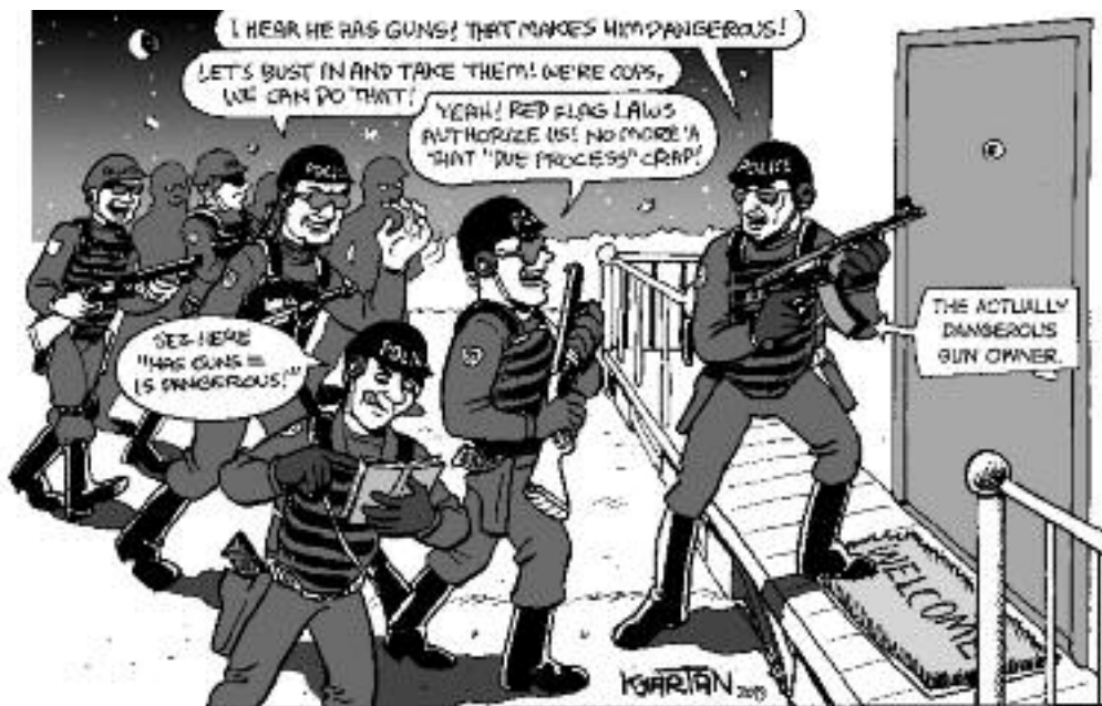
CALLING THE POLICE ON SOMEONE FOR NO GOOD REASON MAY BE LEGAL - BUT MORALLY SPEAKING, IT IS A MURDER ATTEMPT.