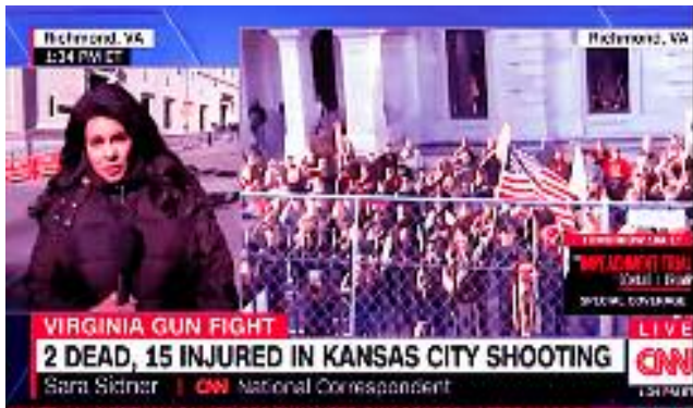
Wag The Dog—CNN invents a gun fight where there is none. Falsely adds caption, and deaths in Kansas to mislead viewers about peaceful event.

The government-licensed broadcast station CNN, violating every tenet of ethics, deemed the heavily