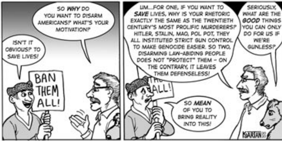
Illustration by Kjartan Arnorsson